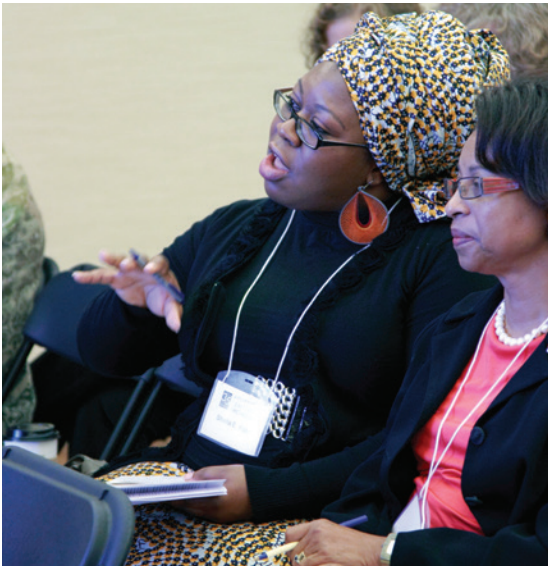
More than 300 attendees participated in the WCW 35th Anniversary Symposium: Reflections, Conversations, New Directions in Wellesley, MA.

Not only will this program increase international visibility for both WCW and Wellesley College, it will also increase the research literacy for a cohort of emerging women leaders and provide valuable research experience and international networking for Wellesley College students. Additionally, it will create opportunity for working leaders and change agents around the world who have limited access to advanced education and professional development programs. While entering the domain of pedagogy is a significantly new venture for WCW as an institution, the considerable expertise of many of our researchers and project directors in the areas of research supervision, training, and, in some cases, teaching, prepares us well to do something innovative, exciting, and timely.