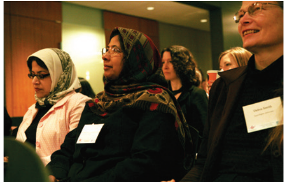
More than 300 attendees participated in the Achieving Equity for Women: Policy Alternatives for the New Administration conference in Washington, D.C.

A third component of this initiative will be to continue serving as an evaluation partner to on-the-ground organizations working on gender equity and other forms of social change in their communities. Over the years, WCW researchers have developed a reputation for offering high quality gender-equity and evaluation-research services to community based organizations, corporations, government agencies, and other institutions. In the coming decade, we seek to build on this reputation by becoming a go-to partner for gender-equity and evaluation research that falls within the purview of our research specialization areas as well as by expanding the work internationally.