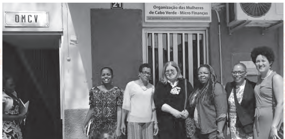
The delegation visited OMCV, a women’s non-government organization that provides services for health, women’s rights, vocational training and pre-primary education, new information and communication technologies, microcredit, income generating activities, and women entrepreneurship, among others.