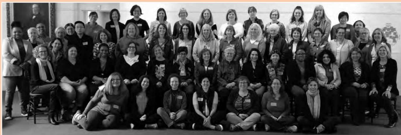
WCW researchers, program staff, and administrators come together twice each year for staff retreats to share important organization updates and to renew energy for the important work undertaken. Pictured are those WCW team members who were a part of the Spring 2017 Retreat.