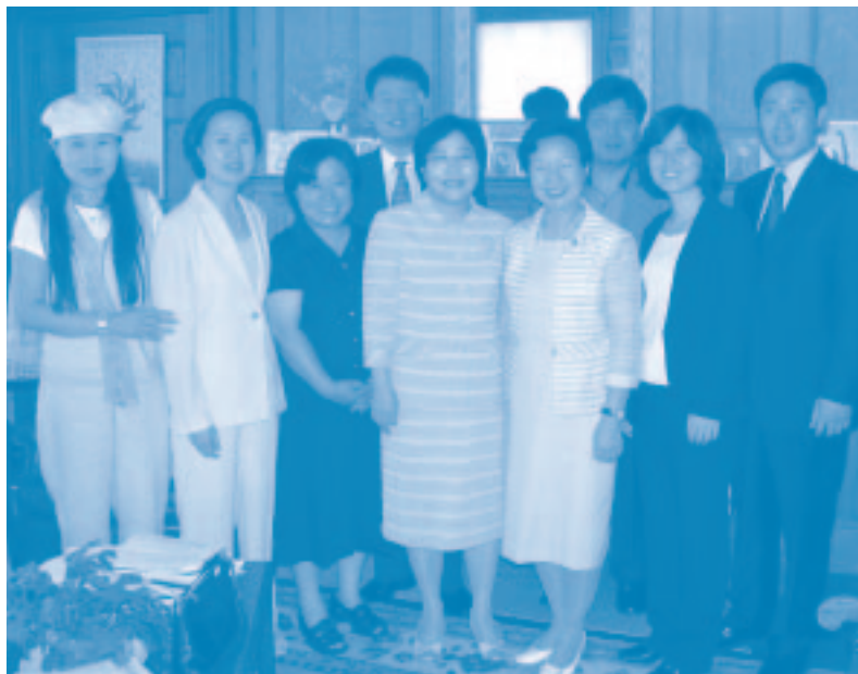
Representatives from the Uri Women's Leadership Center